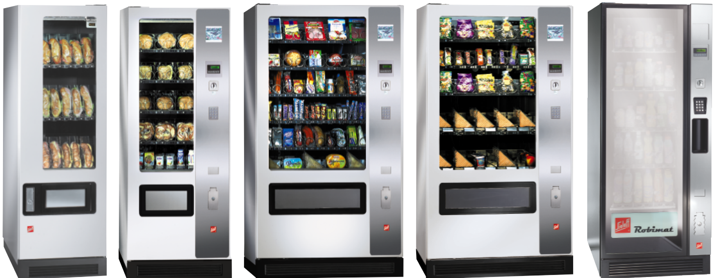
SP 1300 LM

The LM's energy-efficient high-performance chilling unit means that fresh food items can be stored at a temperature below 4°C. The special air circulation of the 2T-version makes it possible to have dual temperature zones within one machine, i.e. in the lower 2 or 3 shelves the temperature is set typically at <+4°C, and in the upper shelves at between 12°C and 18°C. The machine will not vend fresh food items if the temperature rises too high.