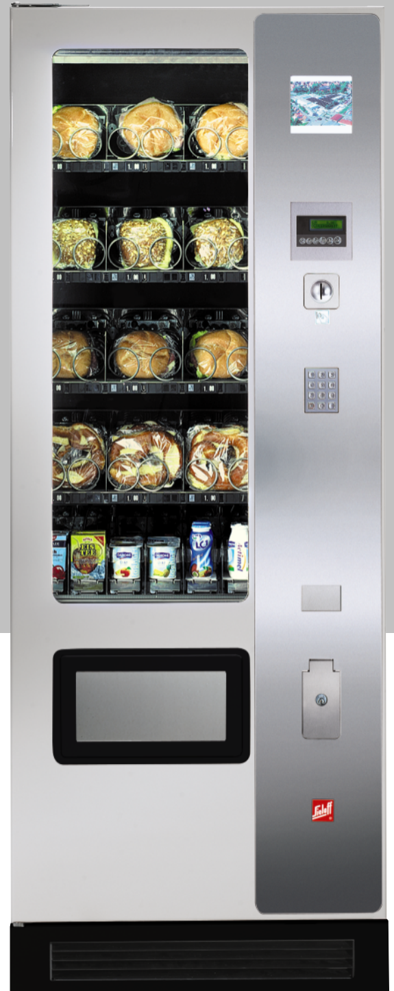
SÜ 1500 LM